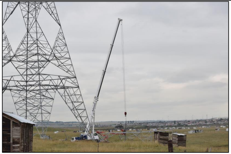
Figure 3: Crane assisting with tower erection.