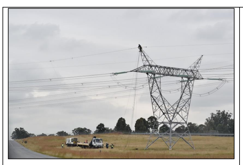
Figure 2: Stringing activities

The following table presents examples of some of the site activities and observations