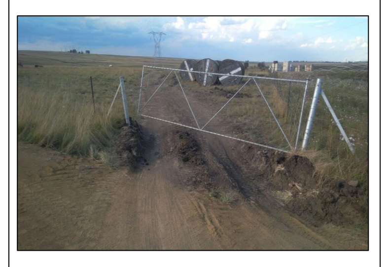
Figure 4: Damage gate on one of the farms